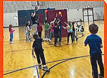
Fun in PE